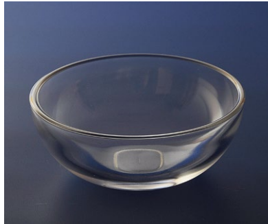
MF 694 ø 110 x 46 x 4 mm