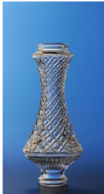
Putsch 679 5290/195