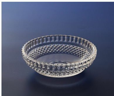
MF 3517 ø 102 x 31 x 4 mm