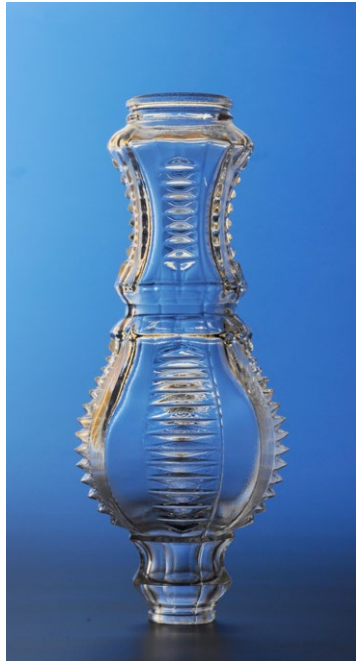
Putsch 660 5269/210