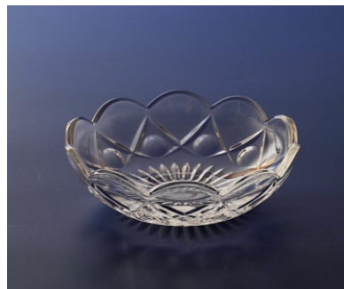
MF 677 ø 100 x 33 x 4 mm