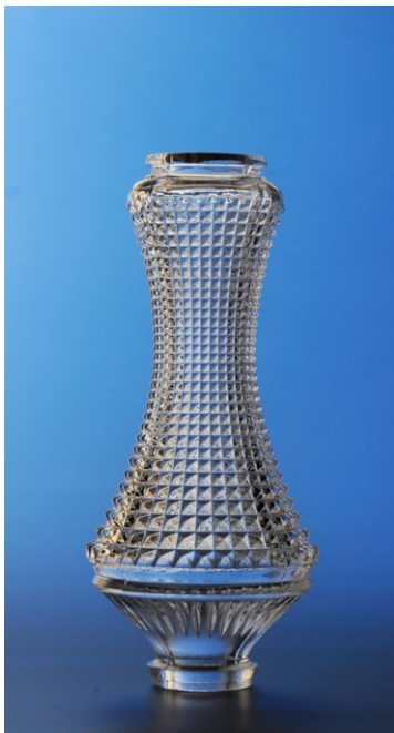
Putsch 676 5241/215