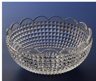
MF 673 ø 130 x 60 x 4 mm