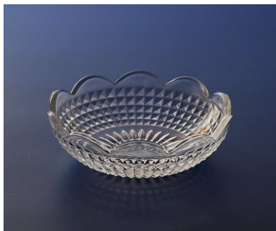
MF 675 ø 100 x 33 x 4 mm