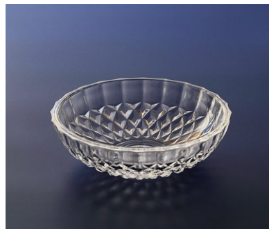
MF 655 ø 103 x 31 x 4 mm