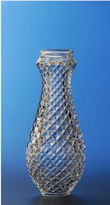
Putsch 657 5226/203