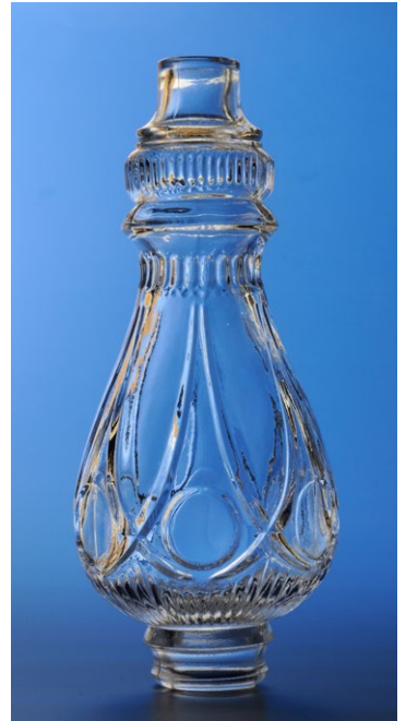
Putsch 670 5270/230