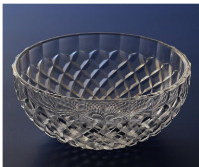
MF 656 ø 130 x 57 x 4 mm