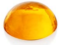
10033 golden topaz