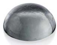
40003 smoke grey

The shown colors can differ from the original.