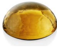
10513 golden smoke